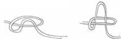
Closer look at bringing Loop through.